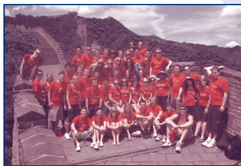
Eller Global Cohort, 2009.

On May 18th, 2009, 50 Eller undergraduate students arrived in Shanghai International Airport. Despite jetlag and a long trip from Tucson, the Eller Global Cohort was excited for their upcoming seven weeks of study