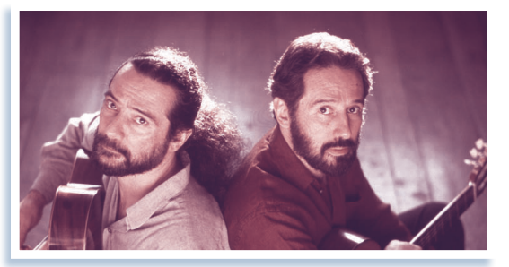
The Assad Brothers, Grammy winning guitar duo

All events will take place at Holsclaw Hall, School of Music